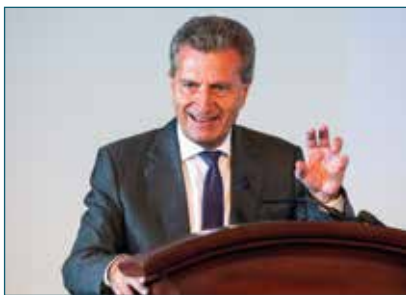
Mr Günther Oettinger