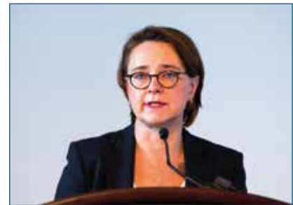
Ms Annette Widmann-Mauz