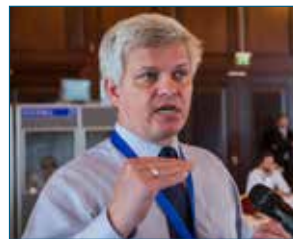
Mr Veiko Spolītis, Member of Parliament of Latvia